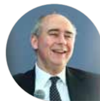
Lord Johnson UK Minister for Investment