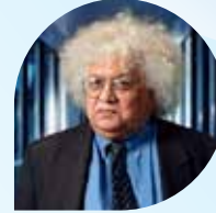
Prof. Lord Meghnad Desai, Emeritus Professor of Economics, London School of Economics and Political Science