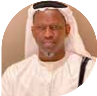
HRH Prince Ebrahim Sanyang of Gambia