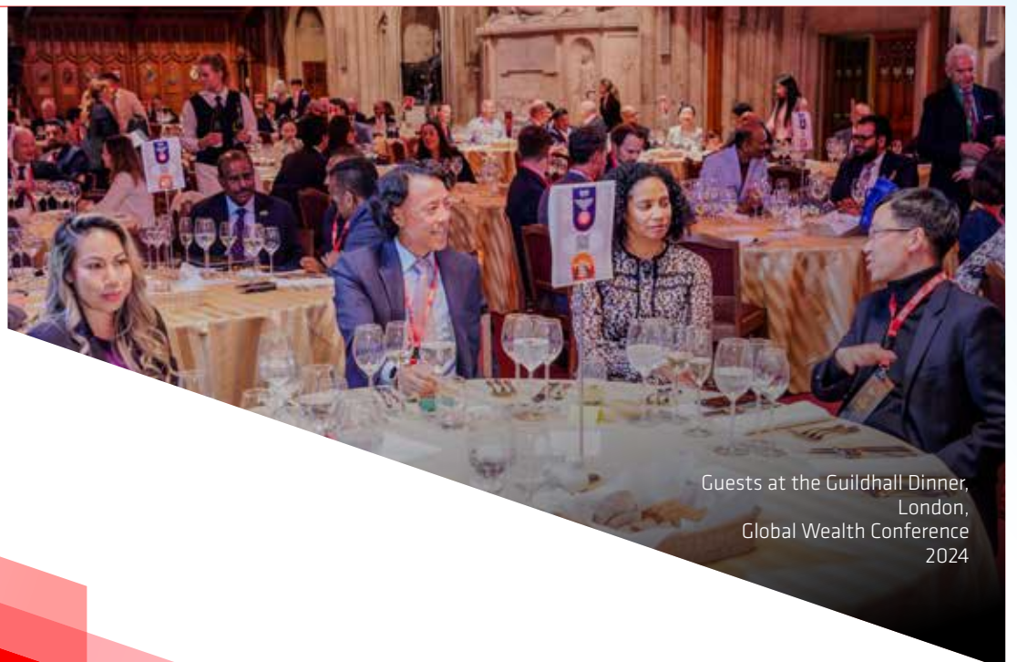
Guests at the Guildhall Dinner, London, Global Wealth Conference 2024