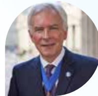
The Rt Hon. The Lord Mayor Alderman, Nicholas Lyons