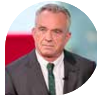
Robert F. Kennedy Jr., US Presidential Candidate