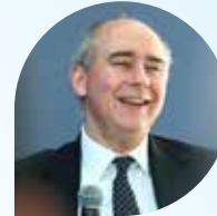
Lord Dominic Johnson, UK Minister for Investment