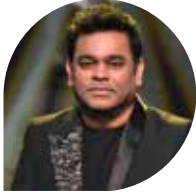
A. R. Rahman, Two-time Oscar winning composer and producer