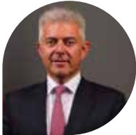
Rt Hon Sir Brandon Lewis CBE, UK Lord Chancellor & Secretary of State