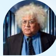
Prof. Lord Meghnad Desai, Emeritus Professor of Economics, London School of Economics and Political Science