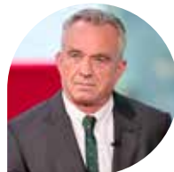
Robert F. Kennedy Jr., US Presidential Candidate