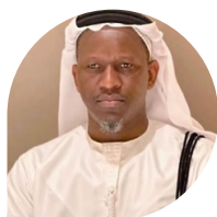
HRH Prince Ebrahim Sanyang of Gambia