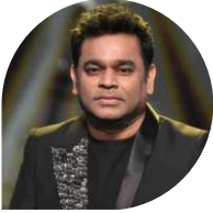
A. R. Rahman, Two-time Oscar winning composer and producer