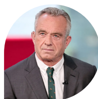
Robert F. Kennedy Jr., US Presidential Candidate