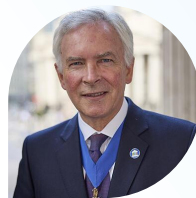
The Rt Hon. The Lord Mayor Alderman, Nicholas Lyons