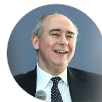
Lord Johnson UK Minister for Investment