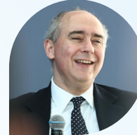
Lord Dominic Johnson, UK Minister for Investment