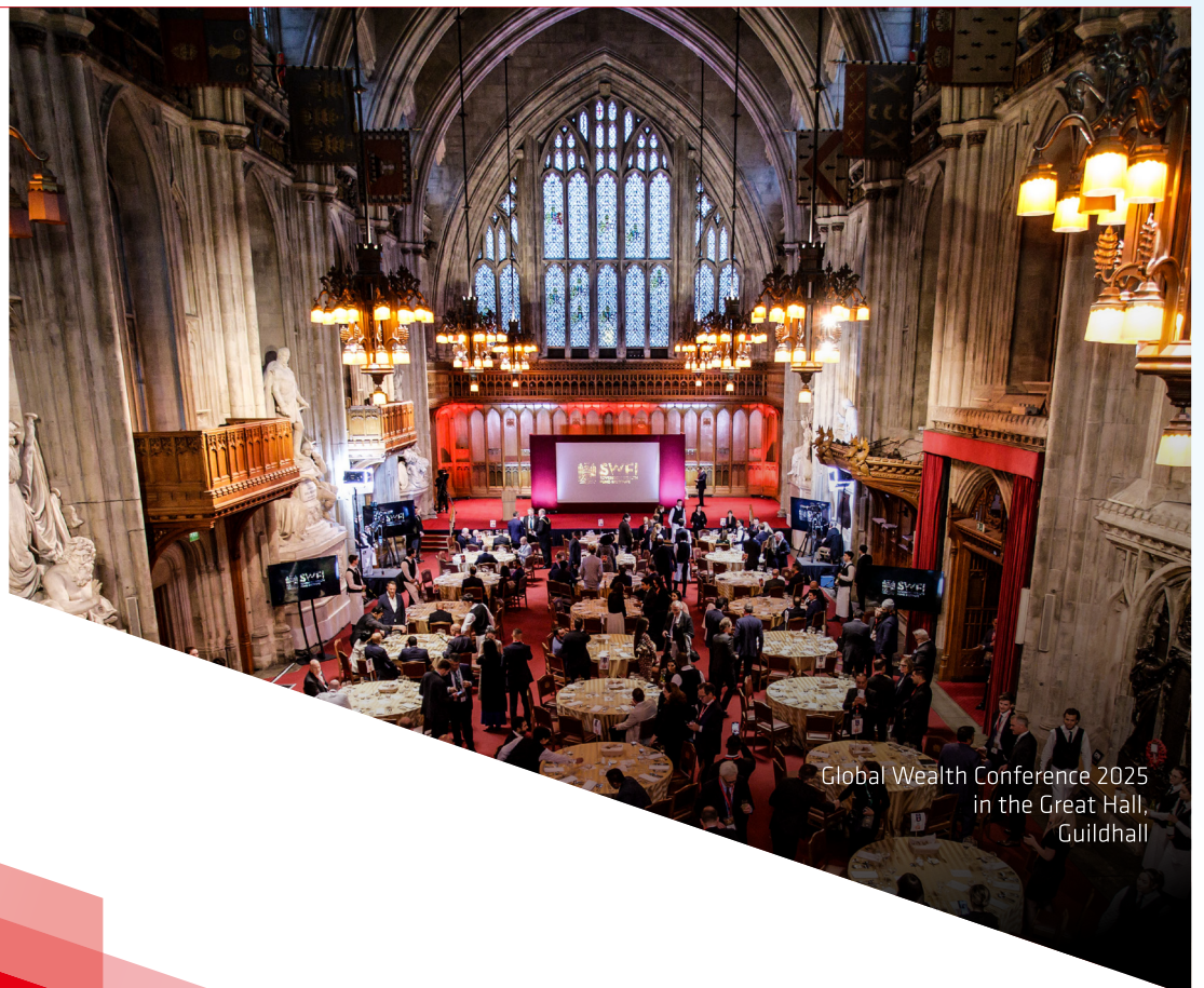
Global Wealth Conference 2025 in the Great Hall, Guildhall