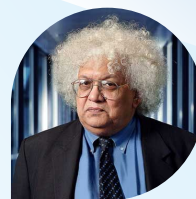
Prof. Lord Meghnad Desai, Emeritus Professor of Economics, London School of Economics and Political Science