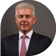
Rt Hon Sir Brandon Lewis CBE, UK Lord Chancellor & Secretary of State