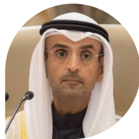
HE Dr Nayef Falah Al-Hajraf, Secretary General, Gulf Cooperation Council (2020-23)