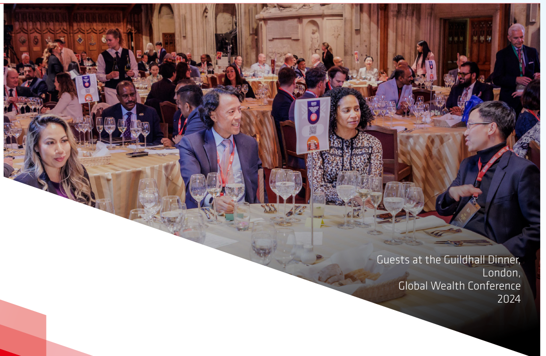
Guests at the Guildhall Dinner, London, Global Wealth Conference 2024

2150 - 2200 Closing Remarks & Vote of Thanks