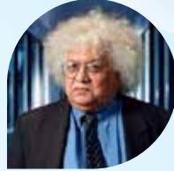
Prof. Lord Meghnad Desai, Emeritus Professor of Economics, London School of Economics and Political Science