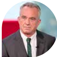
Robert F. Kennedy Jr., US Presidential Candidate