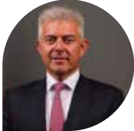
Rt Hon Sir Brandon Lewis CBE, UK Lord Chancellor & Secretary of State