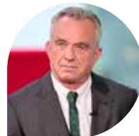
Robert F. Kennedy Jr., US Presidential Candidate