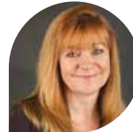
Baroness Kay Swinburne, Member, European Parliament