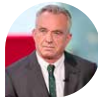
Robert F. Kennedy Jr., US Presidential Candidate