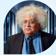
Prof. Lord Meghnad Desai, Emeritus Professor of Economics, London School of Economics and Political Science