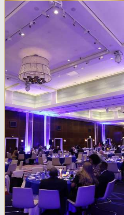
“Celebratory Gala Dinner hosted at the Museum of the Future, Dubai, in the presence of decision makers controlling assets in excess of USD 2 Trillion”