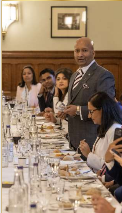
“Celebratory Gala Dinner hosted at the House of Commons, London, United Kingdom, in the presence of decision makers controlling assets in excess of USD 6 Trillion”