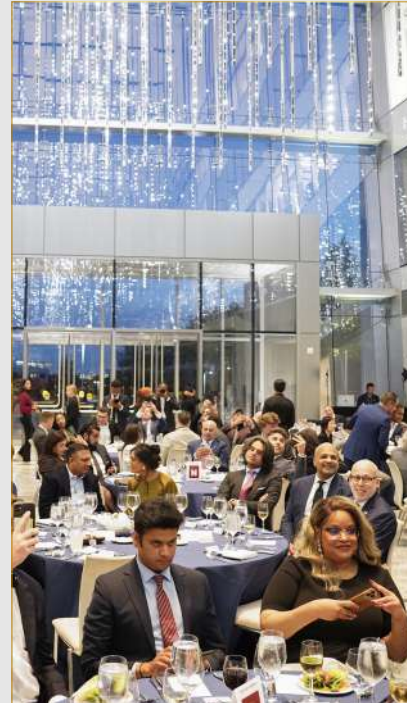
“Celebratory Gala Dinner hosted at the Hall of Fame, Dallas Cowboys Headquarters, Dallas, Texas, United States, in the presence of decision makers controlling assets in excess of USD 11 Trillion