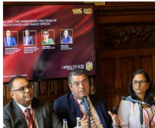
Actual photos taken on GWC 2023, London, House of Commons - Lunch and Panel Discussion.