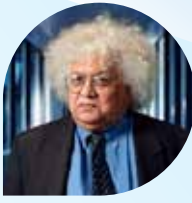
Prof. Lord Meghnad Desai, Emeritus Professor of Economics, London School of Economics and Political Science