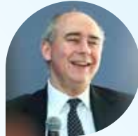
Lord Dominic Johnson, UK Minister for Investment