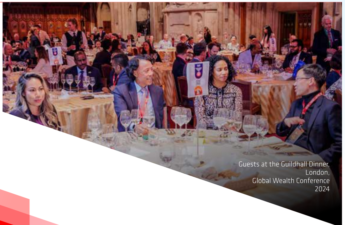
Guests at the Guildhall Dinner, London, Global Wealth Conference 2024

2150 - 2200 Closing Remarks & Vote of Thanks