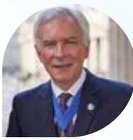
The Rt Hon. The Lord Mayor Alderman, Nicholas Lyons