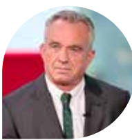
Robert F. Kennedy Jr., US Presidential Candidate